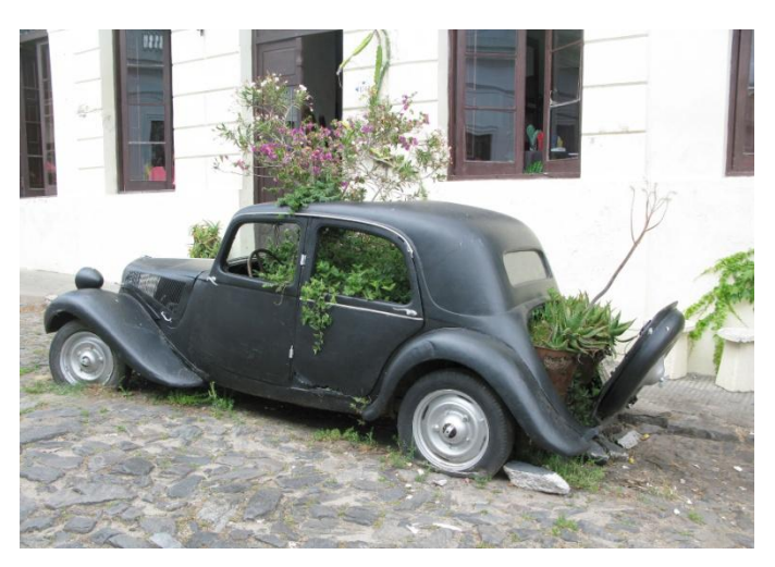
Flower Power by Jill Evans, Highly Commended