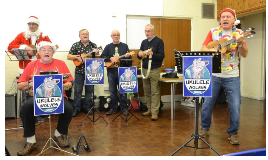
The Ukulele Wolves entertaining us at the December Meeting. They also encouraged us to sing along and it seemed we knew most of the lyrics.

so we were all assembled for boarding when the coach arrived at 4:30. We departed soon after and got back to Cardiff about 6pm – happy but tired.